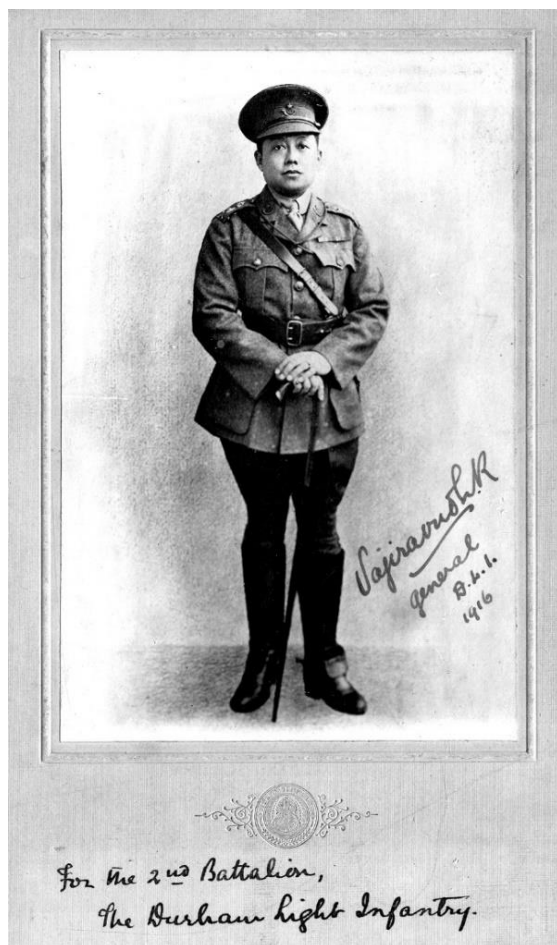
Fig 1.1. HM King Vajiravudh, in his Service Uniform as an honorary British General, with a Durham Light Infantry cap badge, 1916.

socio-political essays and over 1200 books. Rama VI made Thailand one of the first 15 nations to join the Scout movement, which is now in 215 countries. He regulated gambling and prostitution and he ended polygamy. His nephew HRH Prince Chula Chakrabongse categorised him firmly as a liberal. 2 King