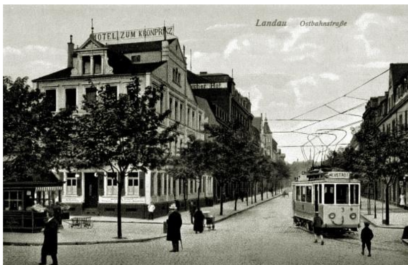
Fig 2.49 The Hotel Zum Kronprinz in Landau where a Siamese Transport Corps Captain had a narrow escape, or a missed opportunity.

We kept going, stayed a night at Landau, 19 (fig 2.49) and reached Mussbach 20 where we stopped. (figs 2.50-2.54)